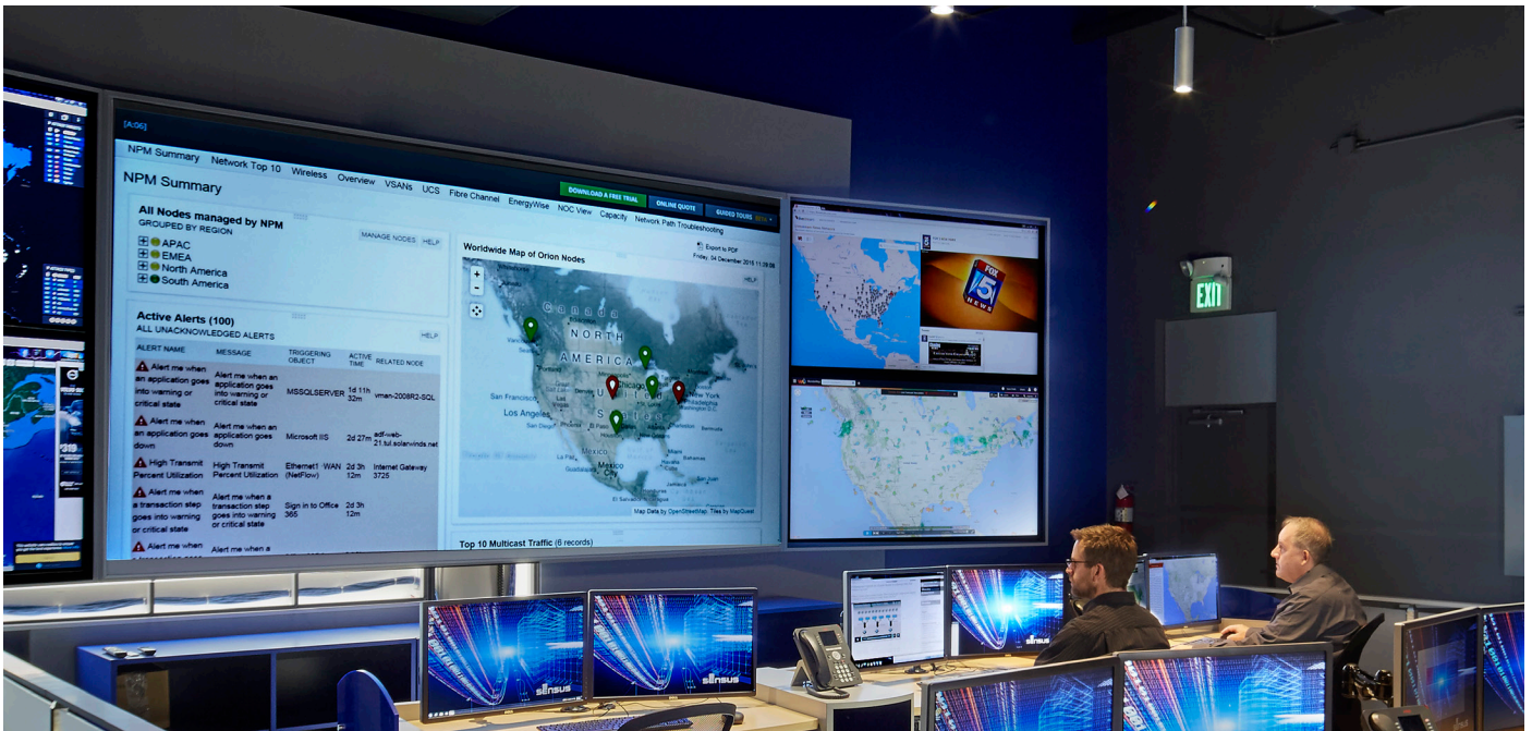
Xylem's network operations center team