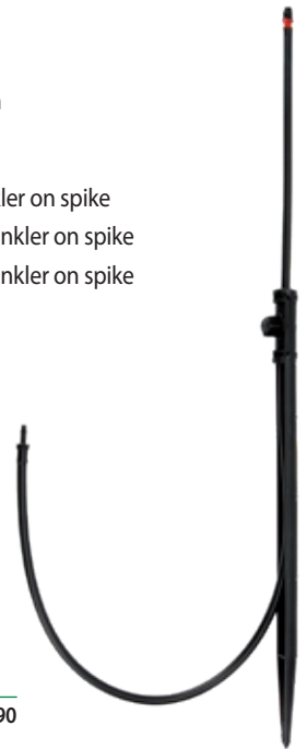
Jet Spike 310-90